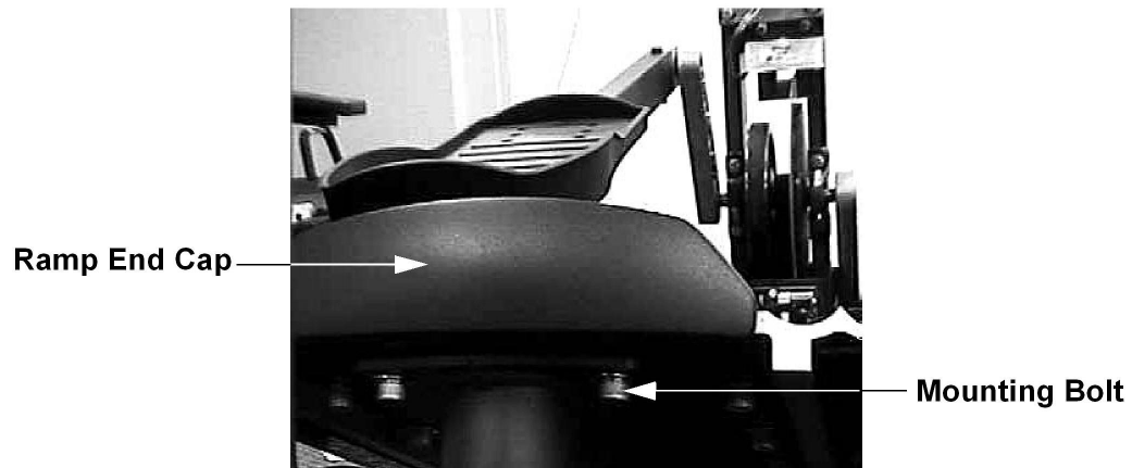
Diagram 7.13 - Front Ramp Mounting